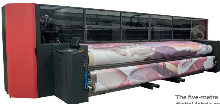
The five-metre wide EFI VUTEK® FabriVU 520 digital fabric printer