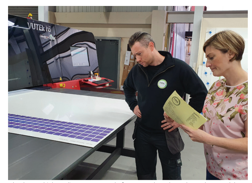
Thanks to a high-quality output speed of up to 109 boards per hour, the VUTEk h5 has helped RMC Digital Print meet demand for increasingly faster turnaround times with production efficiency.

dots per inch, the VUTEk h5 prints with an eight-colour ink set or – using its extended-gamut four-colour inks – four colours in a CMYKx2 configuration.